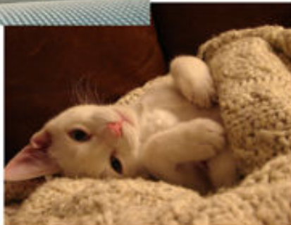
Foster kitten Amos