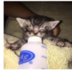
Foster kitten PJ

The Florida Keys SPCA Volunteer Foster Care Program provides temporary housing and care for dogs, cats, puppies and kittens who aren't quite ready for adoption. In 2023, our network of foster volunteers helped to save the lives of over 300 animals! We need loving homes like yours to continue helping these animals in need of a little extra time and care.