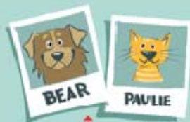
Photos of your pets (printed and on your phone)

Copies of pet medical records (printed and online or stored in an app)